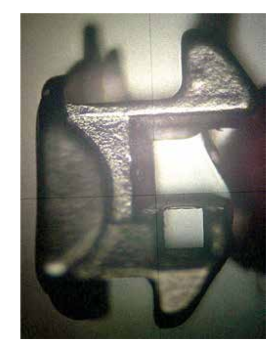
Figura 2. Bracket In-Ovation®.

Cash et al observed that all the slots in the brackets they examined were increased from 5 to 24%, which was the most comprehensive variation. In our study, we found that all self-ligating brackets have slots with larger dimensions than the ideal (0.022"); the bracket