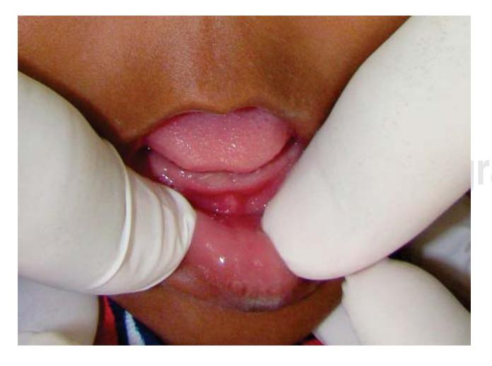
Figure 4. Post surgical control eight days after surgical procedure.