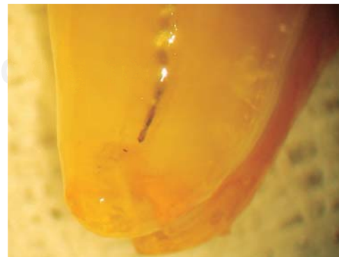
Figure 3. Short working length in mesial canals.