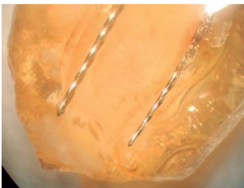
Figure 1. Precise working length in mesial canals.