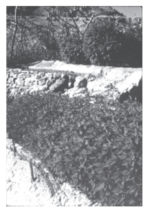
Figure 9. Garden construction techniques including thorny brush as a natural fencing material, horizontal log to form base of one terrace, hand laid stone wall and stairs carved into river bank.

guaje, guamuchil and xocote. Men sometimes hunt for small game and both men and women collect firewood in areas near the river.