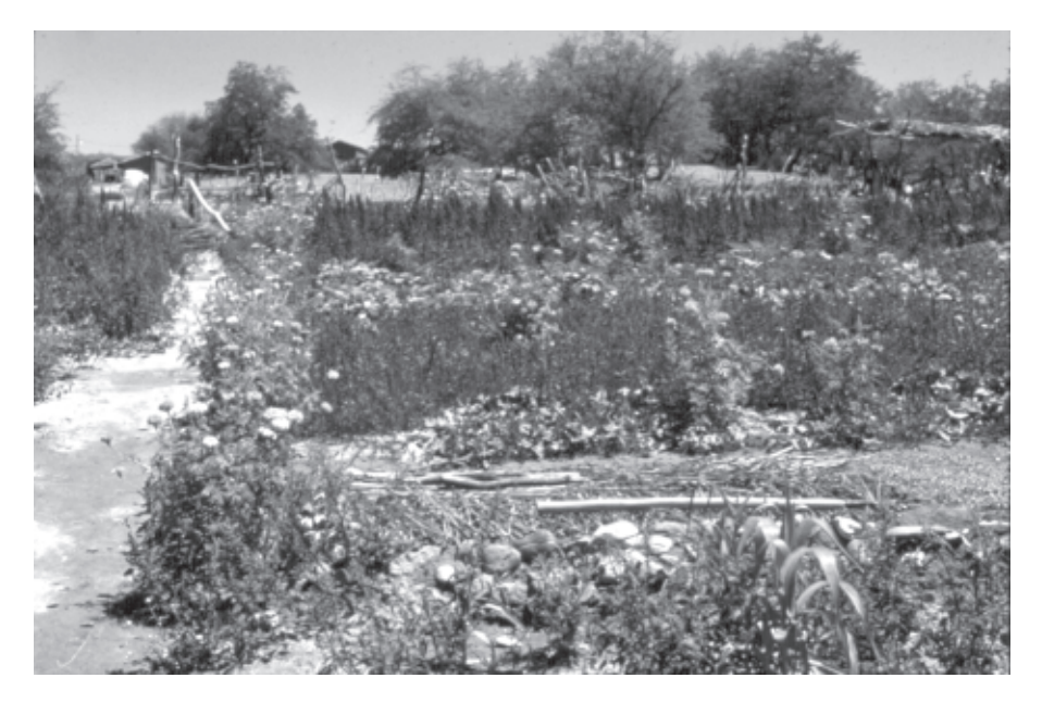
Figure 6. Mature garden with mixed plants including cilantro, epazote, camotes, amaranth, marigolds, chiles, squash and melons. Note poles, straw, stones for building terraces, sleeping shelter in upper right corner.

of the yield is sold in the neighboring villages not on the river – Ameyaltepec, Ahuehuepan and Ahuelican– where access to fresh vegetables and herbs improves the dry season diet. Another important use of the produce is in offerings made during agricultural rituals and "fiestas" for the saints, a topic I briefly explore at the end of this article.