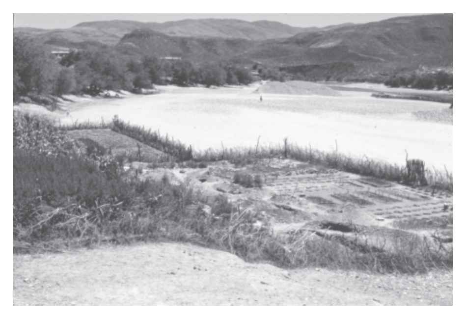
Figure 2. Exposed sandy river bed in dry season, with filtration gardens in foreground and in distance along existing stream. Water reaches the tree line during the rainy season. Note thorny branches as a fencing material, and dry hills in the background.

buckets. Informants in San Agustin Oapan told me that small water wheels (norias) were used in the 1940's and 50's but I did not observe this. Armillas describes the technique as humidity cultivation (cultivo de humedad), Niederberger (2003) calls it humidity horticulture (horticultura de humedad) and Del Amo, et al. (1988) refers to it as tecalli or sandy pit agriculture. I opt for the term huertos de humedad (humidity or filtration gardens) because villagers in San Agustin Oapan use the term huertos in Spanish to describe them.