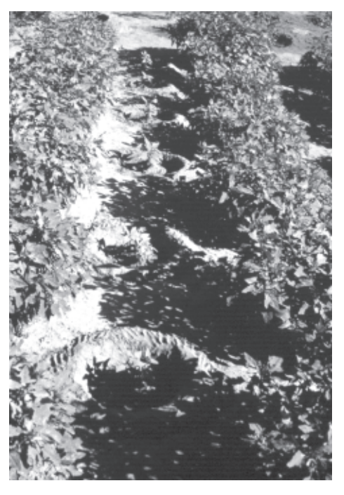
Figure 8. Hand-formed circular borders to pool water at base of bean plants, note finger marks in sandy soil.

can be an expression of identity and personal prestige, intimately tied to social personhood.