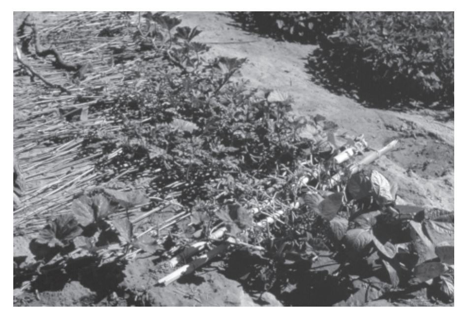
Figure 7. Watermelon and squash plants trained across wooden poles and sesame straw to protect them from the hot sand.

stone walls, stairs and paths within the plots which will be flooded each year at the end of the dry season (figure 9). The layouts of the huertos are quite striking; symmetry in the arrangement of the beds (figures 5 and 2), and the contrasting heights and colors of the plants and flowers as they mature are significant consideration and the Nahuas take this into account in their planning (figure 9).