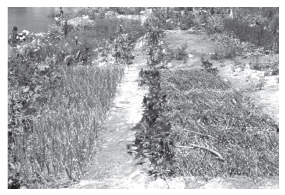
Figure 10. Garden with bed covered in sesame straw to shade tender plants. Plants pictured include green beans, caxtiltzin beans, sunflowers, marigolds, onions, corn, cilantro, epazote, camotes, amaranth, corn, melon. Note woman washing clothes in river and mother preparing to bathe child.

resources for the survival of the families during the dry season, and complements harvests obtained from precarious rainy season milpa agriculture that are often insufficient to last through the year. The sale of some of the produce gives immediate access to welcome cash. But my fieldwork revealed that another primary motivation for planting these gardens is ritual life. An important part of the products from these huertos , especially herbs, flowers, green corn and fruit are used as offerings during the busy festive cycle during the dry season. Despite the apparently Christian symbolism of these festivals, most of the rituals are tied to a ritual geography; they relate to rain-making ceremonies and actions to ensure the fertility of seed and success growing corn in the upcoming agricultural season (Good, 2001a; 2001b; Broda, 2001; Broda and Good, 2004).