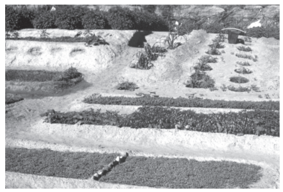
Figure 5. Horizontal beds with amaranth, onions, cilantro, yerbabuena and other greens; round pits with corn, beans, squash, melon and camotes. Note buckets with shoulder yoke for watering.

sometimes they sow seeds in smaller beds and later transplanting sprouts to the terraces.