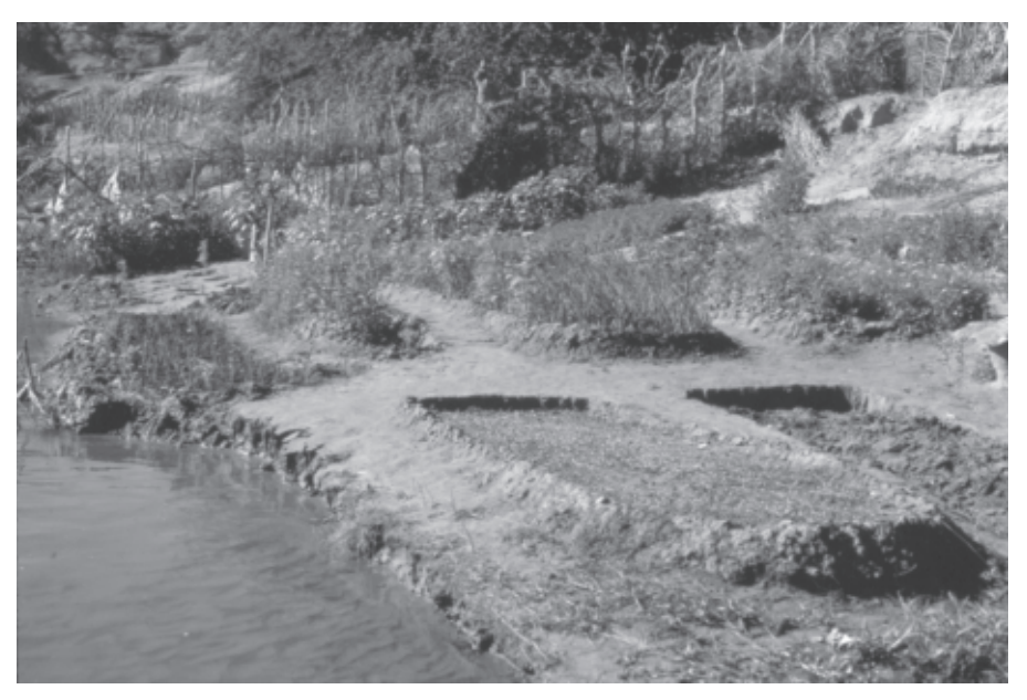
Figure 4. Garden extending to river edge with green branches shoring up a terrace, bed in preparation on right. Plants include cilantro in different stages, onions, epazote, beans, marigolds and greens.

In constructing the terraces Nahuas use stones, wooden logs, poles and sticks, dried stalks of sesame plants, coarse grasses or other plant remains to shore them up (figures 4, 6 and 9). The beds nearest the river receive natural moisture that filters up through the sandy soil, while others are hand watered using gourd dishes to dip water from buckets. The gardens can also be made up of a series of parallel, flat beds measuring approximately 1 x 3 meters, sometimes alternating with rows of round, shallow pits² (figures 2 and 5). Gardeners cultivate a large variety of plants in a very limited space and mix them within the same beds. They are aware of growth cycles and time planting to ensure that their huertos remain in constant production from January through May;