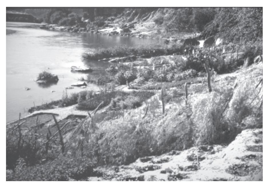
Figure 3. Group of 8-10 adjoining gardens on steep banks where the river curves. Note flat rocks placed for washing in the river, white rags tied to poles as scarecrows.

The gardens consist of flat rectangular beds built in a series of small terraces on the sandy soil. They are extended gradually in step-like fashion down to the waters edge as the river level drops throughout the dry season (figures 4 and 5). Thorny brush is cut and tied to posts to make a barrier around the gardens to keep out pigs, goats, burros and cattle. The gardening implements are simple and readily available to all –shovels, hoes, digging sticks (coas), machetes, buckets and gourds. The crucial resources for these gardens are labor, time and the highly specialized knowledge and experience they require. Men, women and children work together, but I observed that women's labor is essential and the gardens can be successfully cultivated by women