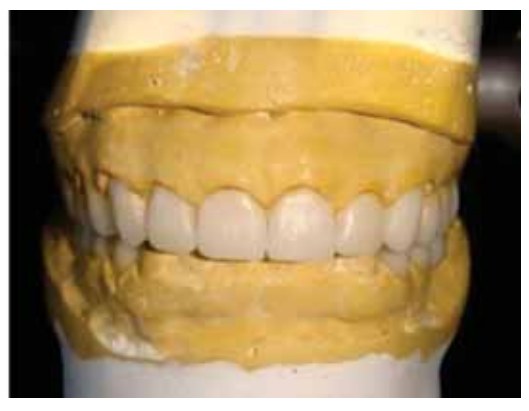
Figure 3. Diagnostic wax-up.