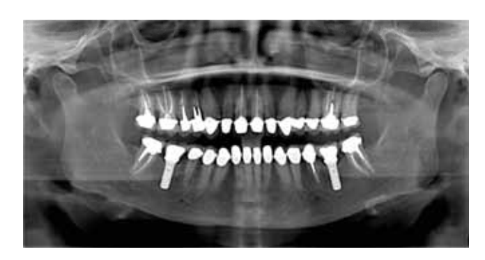
Figure 9. Final panoramic X-ray.

well as implants, require knowledge and application of biological and mechanical principles.<sup>14</sup>