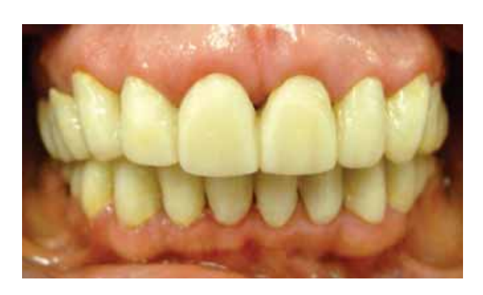
Figure 6. Provisional dentures. Clinical characteristics six months after lengthening the crowns.

Successful combination (amalgamation) of periodontal and restorative procedures, in teeth as